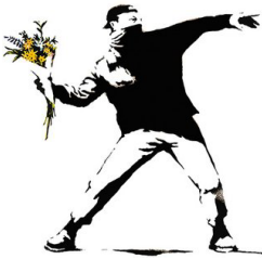
Society as change (above: Banksy)...

Department of Sociology and Social Work University of Wisconsin-Stevens Point